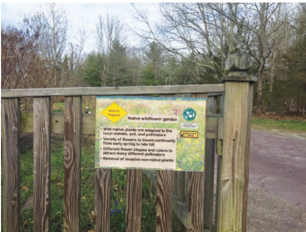
LEFT: Temporary sign explains the work underway at the Triangle Garden.

Other spring activities will focus on the inner area of the Triangle Garden and include mulch spreading and fencing, followed by planting. All of these activities are being planned with precautions including social distancing. By summer we will be looking for volunteers to help with scheduled watering of the new plantings. Meanwhile, if you are out walking at Bare Cove Park, take a look at the site as work progresses.