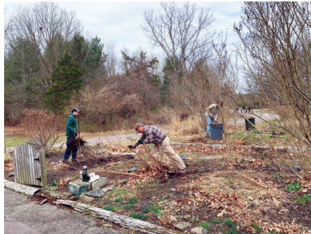
LEFT: HLCT board members Zak Mertz (left) and Helmut Fickenwirth remove non-native plants and overgrowth from the Triangle Garden site.